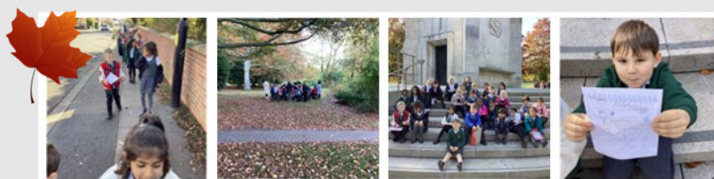
Year 1 enjoyed their Memorial Park walk this week to celebrate Autumn.