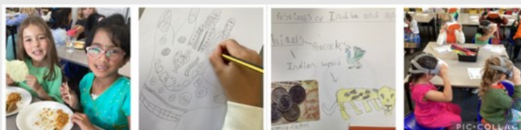
Year 2 enjoyed celebrating a wonderful Wow Day all about India. They designed their own fact files and mehndi hand patterns and enjoyed Bollywood Dancing. The children even visited India via VR Headsets. A highlight of the day was food tasting where samosas, poppadoms, chutney, raita and rice were all sampled. Yum!